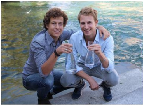
Wasser für Wasser